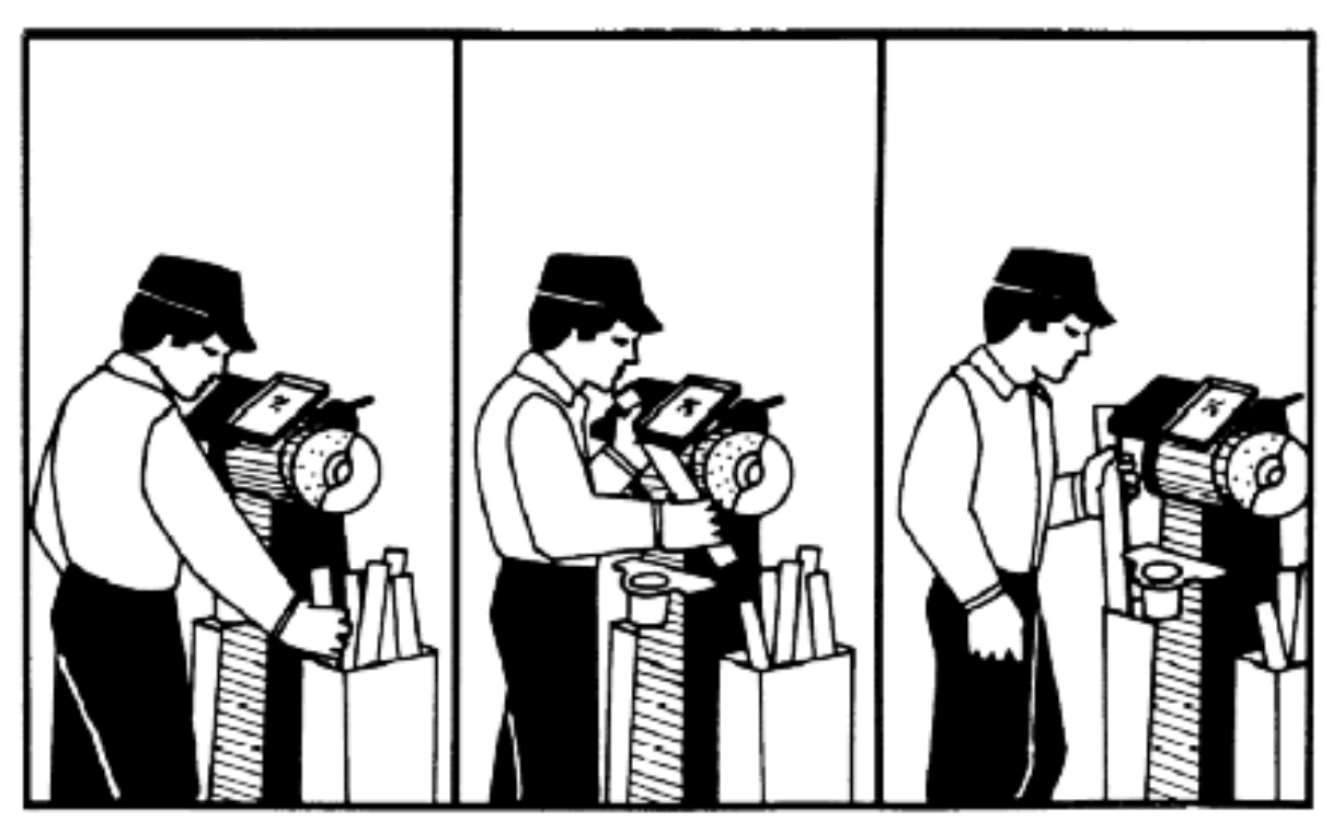
Figure 3. Grinding Castings: New Procedure or Protection

Figure 3 identifies the basic job steps for grinding iron castings and recommendations for new steps and protective measures.