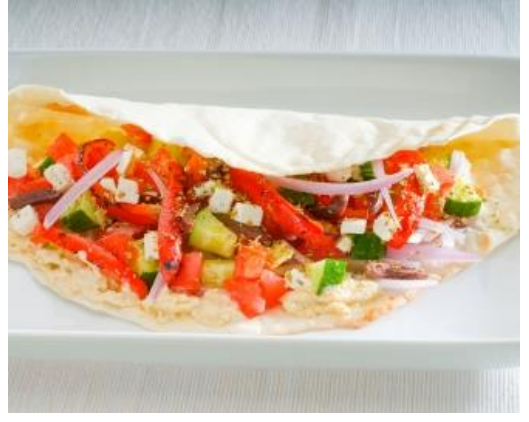
Vegetable Wrap: $4.00, 1 serving