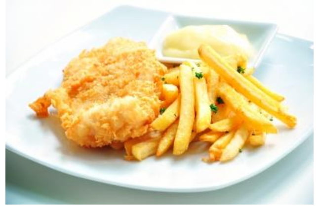
Fast Food Fish and Chips: $5.00, 1 serving