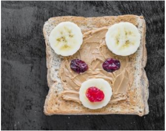
Whole Wheat Toast with Peanut Butter & Banana: $1.20, 1 serving