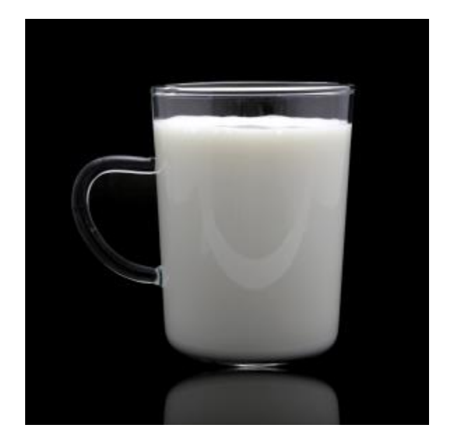
Milk: $2.00, 4 servings. $ 0.50 per serving