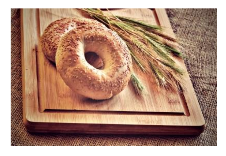
Whole Wheat Bagels: $5.30, 6 Servings