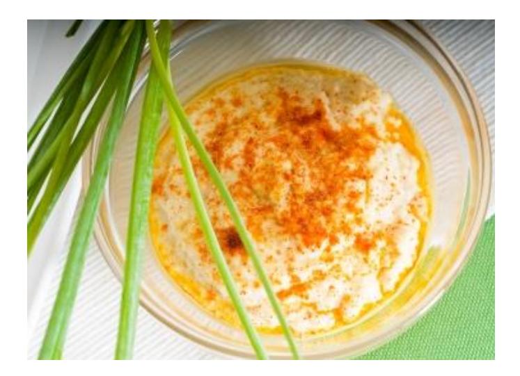
Veggies and Hummus: $2.00, 1 serving