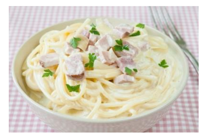
Frozen Fettuccini Alfredo: $1.10, 1 serving

Zucchini: $2.00 per pound, 3 servings per pound