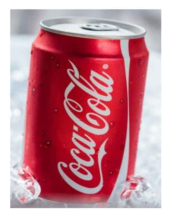
Soda: $0.75, 1 serving