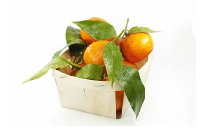
Mandarin Tangerines: $4.99/bag, $0.50 cents per serving

Turkey sandwich with salad: $3.00, 1 serving