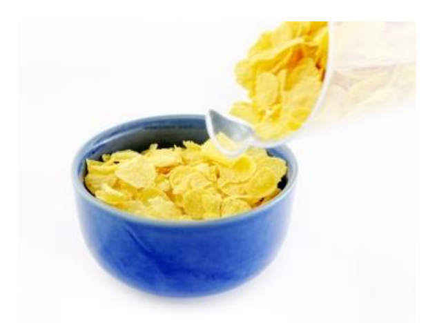
Corn Flakes: $2.99, 10 Servings