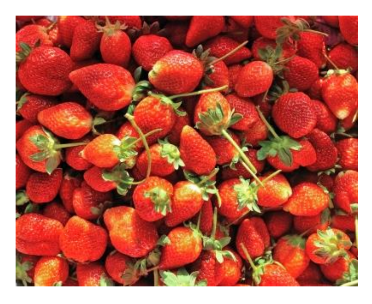
Strawberries: $3.00, 3 Servings, $1.00 per serving