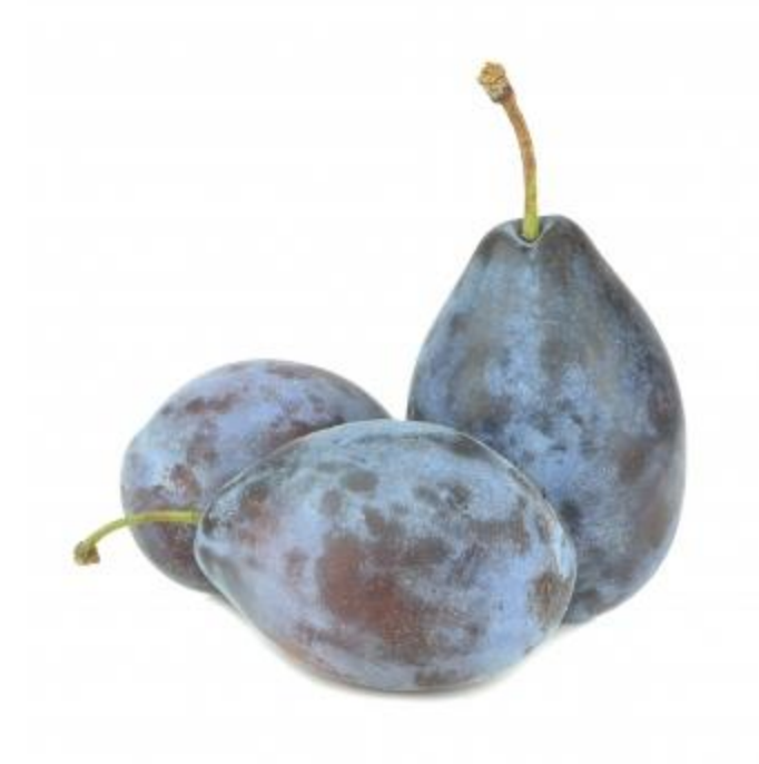
Plum: $0.75, 1 serving