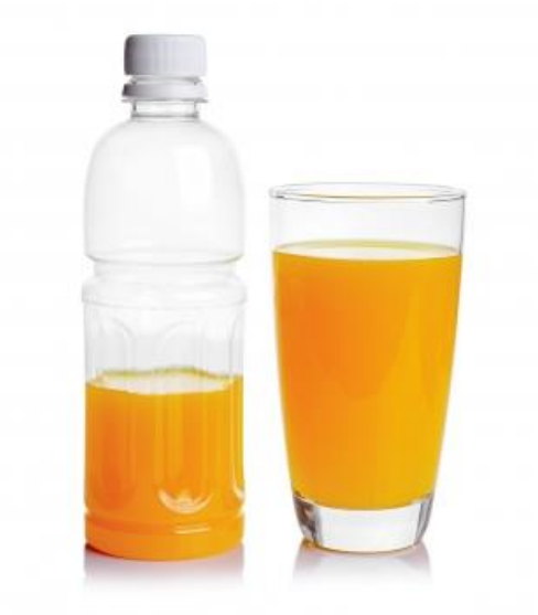
Juice: $3.50 per bottle, $0.70 per serving