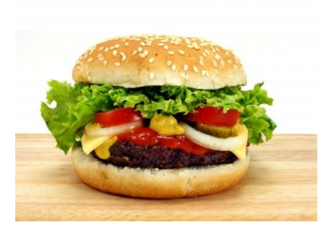
Turkey Burger with Mixed Vegetables: $4.25, 1 serving

750 Curtner Avenue San Jose, CA 95125 T 408-266-8866 F 408-266-9042