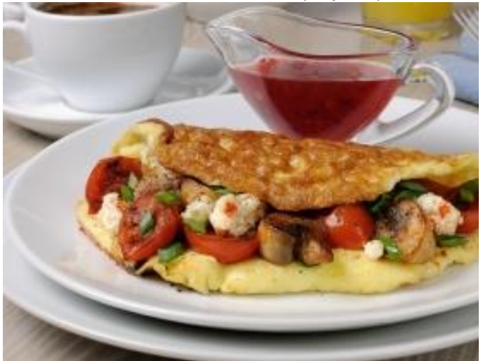
Turkey bacon and vegetable omelet: $4.68, 4 Servings