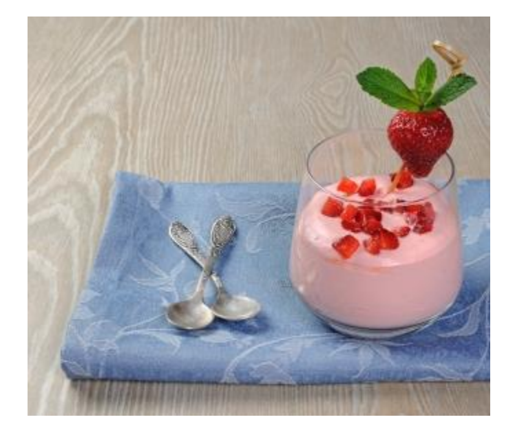
Yogurt & Fresh Berries: $3.20, 1 Serving