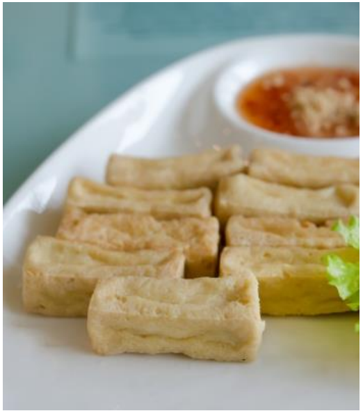
Tofu: $2.00 per package, 3 servings per package