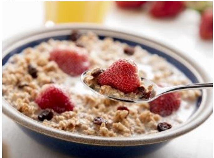
Oatmeal, Fresh Berries & Low Fat Milk: $3.20, 1 Serving