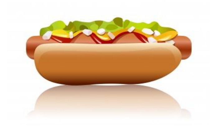
Hot Dog: $1.15, 1 serving