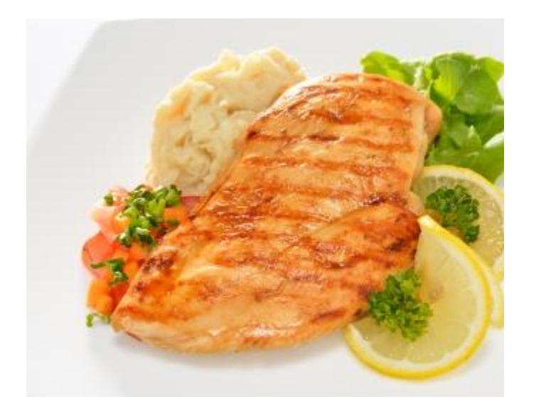
Chicken Breasts: $3.50 per pound, 2 servings per pound