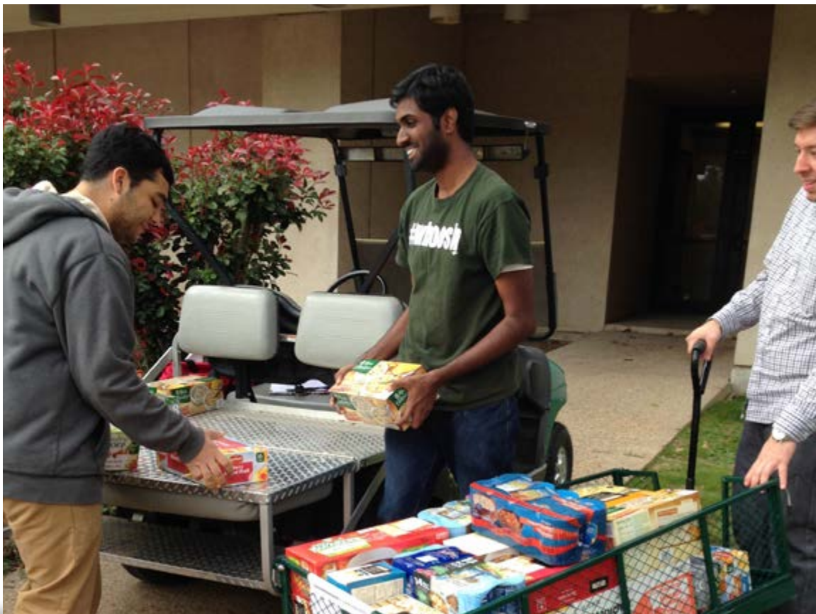
UT Dallas Comet Cupboard staff

Running a campus food pantry is a significant undertaking that requires careful planning and a dedicated team of leaders and volunteers. This toolkit provides the resources that your student government needs in order to create and operate a successful food pantry on your campus.