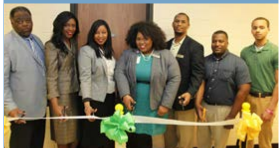
Pine Bluff Student Food Pantry

The Student Food Pantry at the University of Arkansas at Pine Bluff has benefited greatly from collaborating with community partners. The Jefferson County 4-H Foundation serves as the pantry's fiscal sponsor and the pantry is a member of the Arkansas Foodbank network. In addition, the pantry was established as an outreach project of the Arkansas-Pine Bluff Collegiate 4-H Club and the campus Minorities in Agriculture, Natural Resources and Related Sciences (MANRRS) chapter.