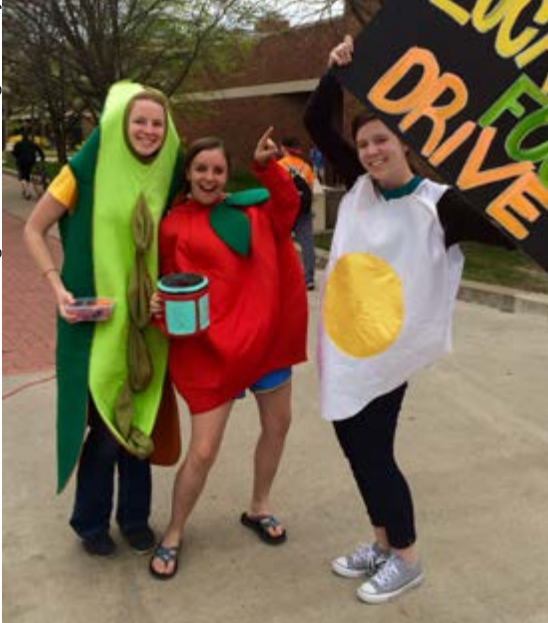
Students from the University of Missouri's Tiger Pantry get dressed up to collect donations for a local food drive.