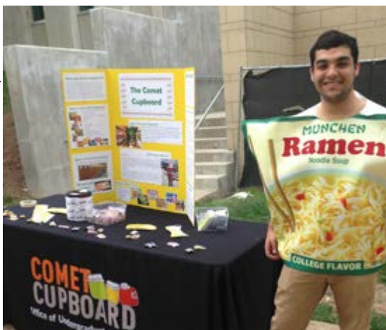
The Comet Cupboard at the University of Texas at Dallas tables on campus to raise awareness about the pantry.