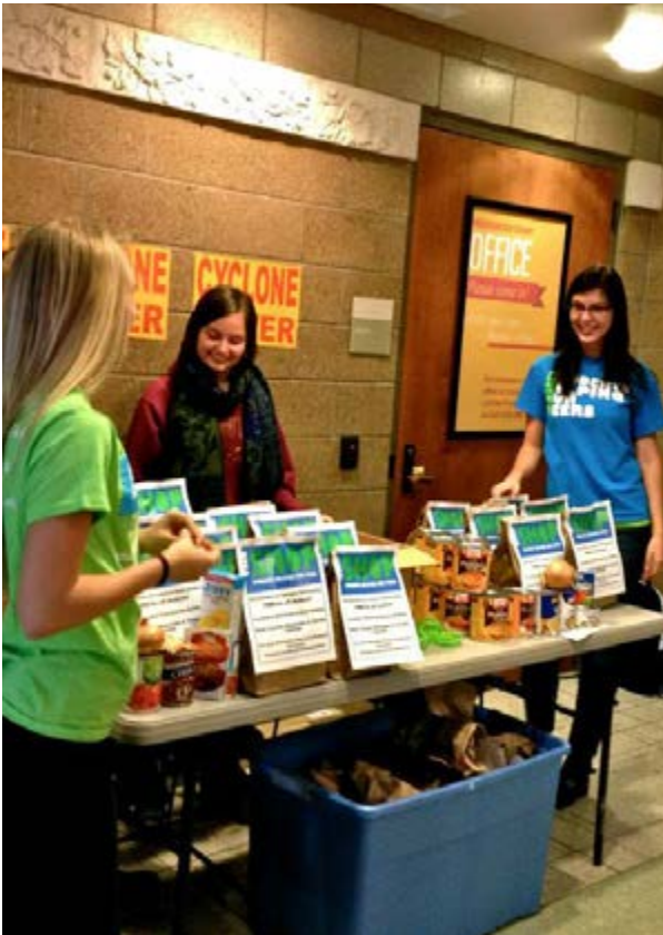
ISU SHOP staff

The Comet Cupboard at the University of Texas at Dallas works hard to publicize their program. In addition to posters, leaflets, and other common promotional items, they go a step further to spread awareness on campus. In addition to setting up information tables with great decorations, they also have a big green wagon that they fill with canned goods and wheel around campus.