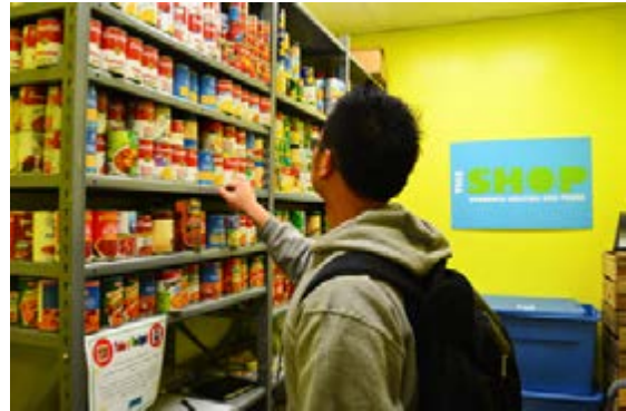
ISU SHOP staff

Clearly, hunger is a real problem for far too many of today's students. However, thanks to misconceptions about the real economic challenges faced by students, there is little recognition of the problem and far too few support systems in place to help students in need.