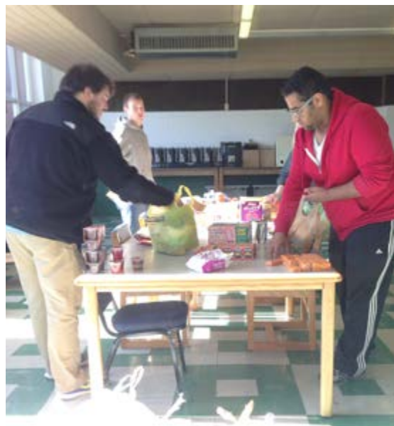
TTU Food Pantry