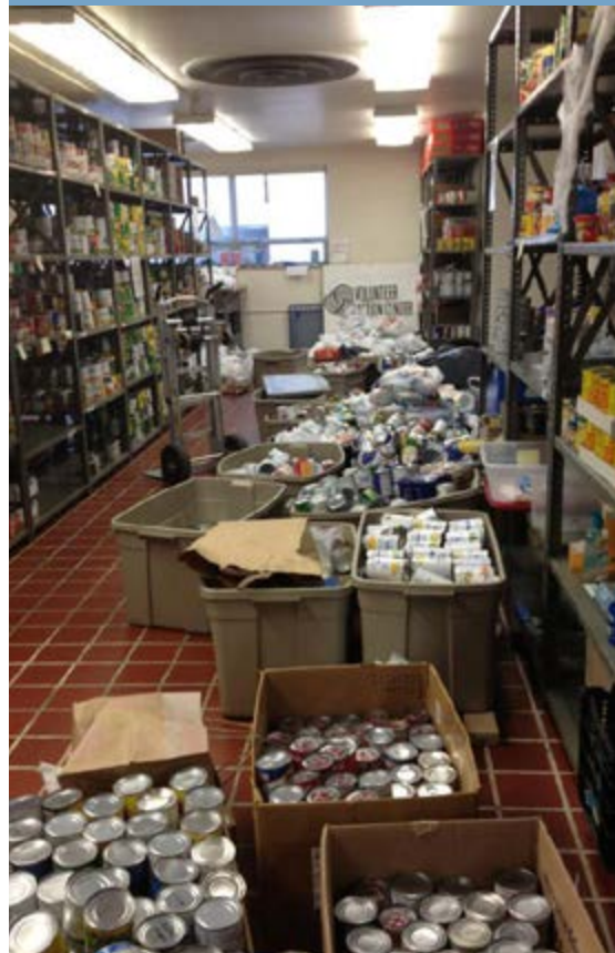
Full Circle Campus Food Pantry

The Full Circle Pantry at the University of Arkansas runs a fundraiser through the school's annual Homecoming 5K run. Fraternities, sororities and other student organizations compete to raise the most money for the pantry. Last year, the run raised enough money to buy 12,000 pounds of food.