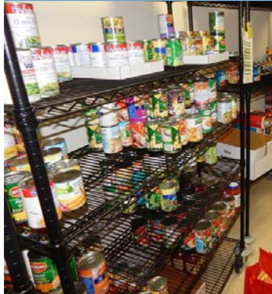
Pulaski Technical College Food Pantry

The Pulaski Technical College Food Pantry occupies a nontraditional space. Housed in a large storage closet connected to a lecture hall in the Campus Center, the pantry is centrally located and easily accessible to those who need it. The pantry is able to provide shelf-stable foods, fresh produce, and perishable items thanks to their commercial refrigerator.