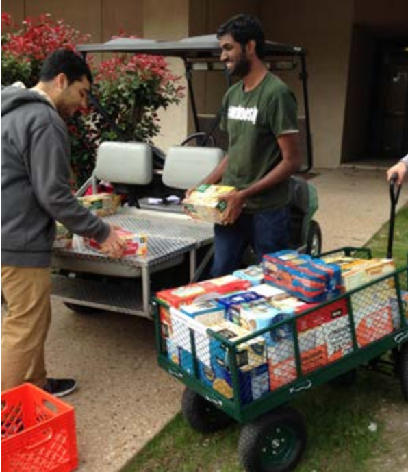
UT Dallas Comet Cupboard staff